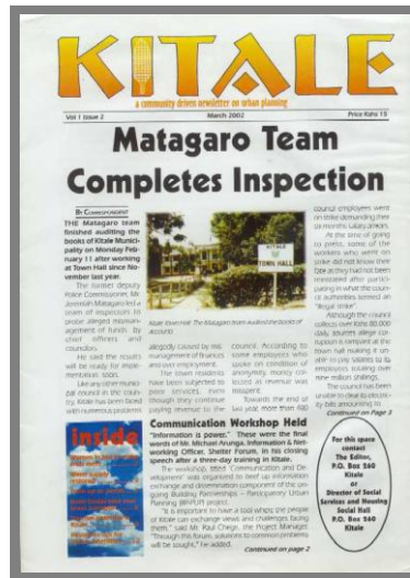
March 2002 issue of 'Kitale'